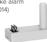
OPTIONAL RF Module Model: EP-HYB-RF-MOD